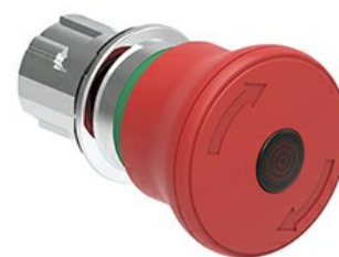
Illuminated mushroom head button actuators - Latch, turn to release Ø 40mm/1.6" LPSBL66