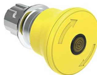
Illuminated mushroom head button actuators - Latch, turn to release Ø 40mm/1.6" LPSBL66