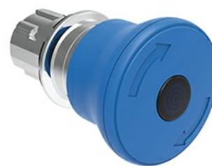
Illuminated mushroom head button actuators - Latch, turn to release Ø 40mm/1.6" LPSBL66