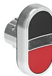
Double-touch actuators, spring return white indicator - Two flush pushbuttons LPSBL71