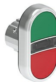
Double-touch actuators, spring return white indicator - Two flush pushbuttons LPSBL71