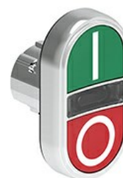
Double-touch actuators, spring return white indicator - Two flush pushbuttons LPSBL71