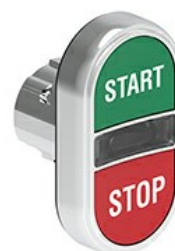
Double-touch actuators, spring return white indicator - Two flush pushbuttons LPSBL71