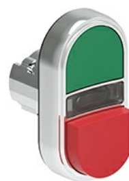
Double-touch actuators, spring return white indicator - One extended and one flush pushbuttons LPSBL72