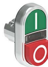
Double-touch actuators, spring return white indicator - One extended and one flush pushbuttons LPSBL72