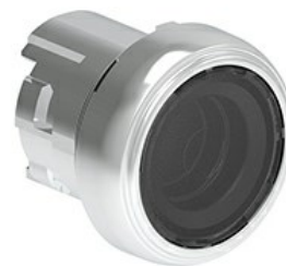
Illuminated push- push button actuators - Flush LPSQL10