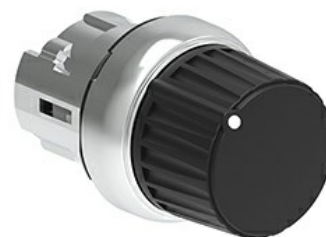
Selector switch actuator knob - 3 position LPSS43