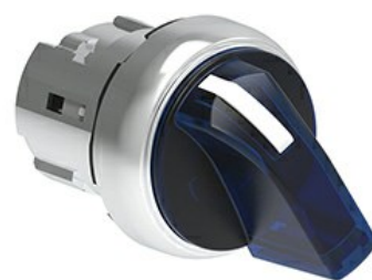
Illuminated selector switch actuator - 2 position LPSSL12