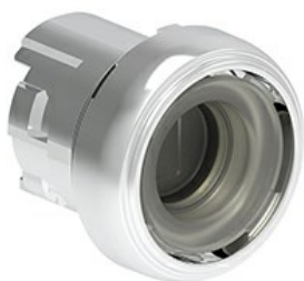
Illuminated actuator without cap LPSXQL0