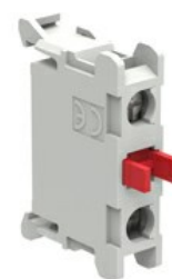
Contact elements, base mount on LPZ control station LPXCB