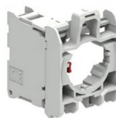
Contact elements - with mountin adapter LPXE