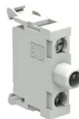
LED elements steady light base mount on LPZ control station LPXLPB