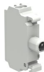
LED elements steady light with spring-clamp terminals LPXLP