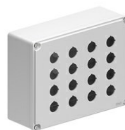
Enclosures with cut-outs for Ø22mm units - with multiholes for 16 actuators LPZM