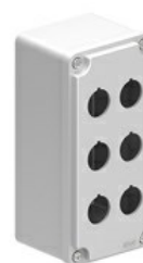
Enclosures with cut-outs for Ø22mm units - with multiholes for 6 actuators LPZM