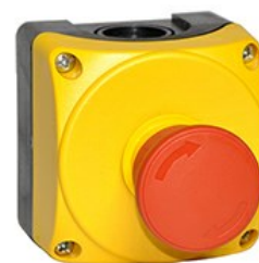
Plastic control station with one actuators - Yellow, 1 way LPZP1A5 LPZP1B503