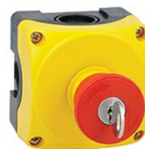
Yellow control station LPZP1A5 complete with mushroom pushbutton turn-key-to-release LPCB6844 1NO+1NC LPZP1B5607