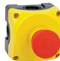
Yellow control station LPZP1A5 complete with mushroom pushbutton pull-to-release LPCB6744 2NC LPZP1B5609