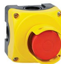
Yellow control station LPZP1A5 complete with mushroom pushbutton pull-to-release LPCB6744 1NC and padlockable protection lpxau158 LPZP1B5611