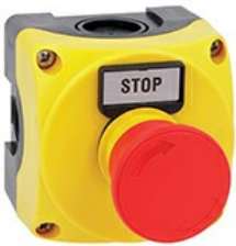
Yellow control station LPZP1A5 complete with mushroom pushbutton turn-to-release LPCB6344 1NC and label holder with label "stop" LPZP1B5612