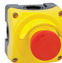
Yellow control station with shroud LPZP1A5P complete with mushroom pushbutton turn-to-release LPCB6644 1NC LPZP1B5P603