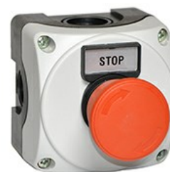
Plastic control station with one actuators - Grey, 1 way LPZP1A8 LPZP1B802