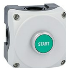
Grey control station LPZP1A8 complete with green flush pushbutton "start" LPCB1163 1NO LPZP1B8101