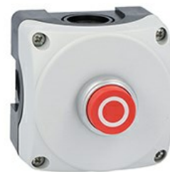
Grey control station LPZP1A8 complete with red extended pushbutton "o" LPCB2104 1NC LPZP1B8104