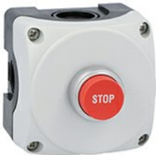
Grey control station LPZP1A8 complete with red extended pushbutton "stop" LPCB2134 1NC LPZP1B8105