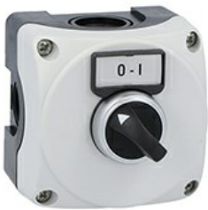
Grey control station LPZP1A8 complete with lever selector lpcs120 1NO and label holder with label "o-i" LPZP1B8300