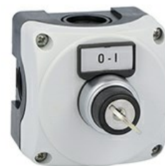
Grey control station LPZP1A8 complete with key selector lpcs320 1NO and label holder with label "o-i" LPZP1B8301