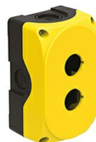
Plastic control station without actuators - for 2 actuators LPZP2A5