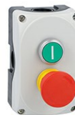
Grey control station LPZP2A8 complete with green flush pushbutton "I" LPCB1133 1NO and mushroom pushbutton turn-to-release LPCB6644 1NC LPZP2B8904