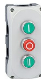
Grey control station LPZP3A8 complete with green flush pushbutton "I" LPCB1113 1NO, red extended pushbutton "O" LPCB2104 1NC and green flush pushbutton "II" LPCB1123 1NO LPZP3B8903