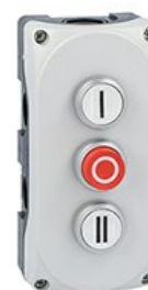
Grey control station LPZP3A8 complete with white flush pushbutton "i" LPCB1118 1NO, red extended pushbutton "o" LPCB2104 1NC and white flush pushbutton "ii" LPCB1128 1NO LPZP3B8905