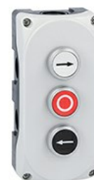
Grey control station LPZP3A8 complete with white flush pushbutton "right arrow" LPCB1148 1NO, red flush pushbutton "o" LPCB1104 1NC and black flush pushbutton "left arrow" LPCB1142 1NO LPZP3B8908