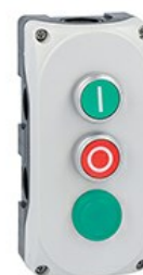
Grey control station LPZP2A8 complete with green flush pushbutton "i" LPCB1113 1NO, red flush pushbutton "o" LPCB1104 1NC and green pilot light 24V LPZP3B8910