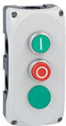
Grey control station LPZP3A8 complete with green flush pushbutton "I" LPCB1113 1NO, red extended pushbutton "O" LPCB2104 1NC and green pilot light 24V LPZP3B8911