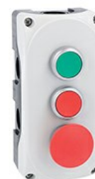
Grey control station LPZP3A8 complete with green flush pushbutton LPCB103 1NO, red flush pushbutton LPCB104 and mushroom pushbutton spring return LPCB6144 LPZP3B8912