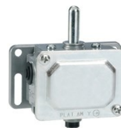
Manual reload and magnetic release - Top push rod plunger PLA1AM