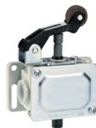
Roller centre push lever PLN...H