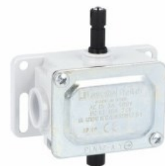
Top push rod plunger PLN...A