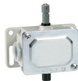
Top push rod plunger PLN...A