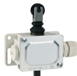
Top roller push plunger PLN...R