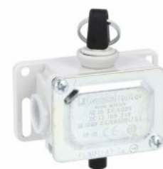
Rope-pull lever without reset button PLNU1AT