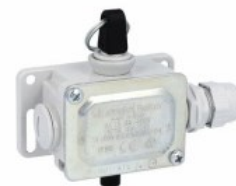
Rope-pull lever without reset button PLNU1ATW