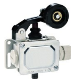
Roller centre push lever PLN...HSB