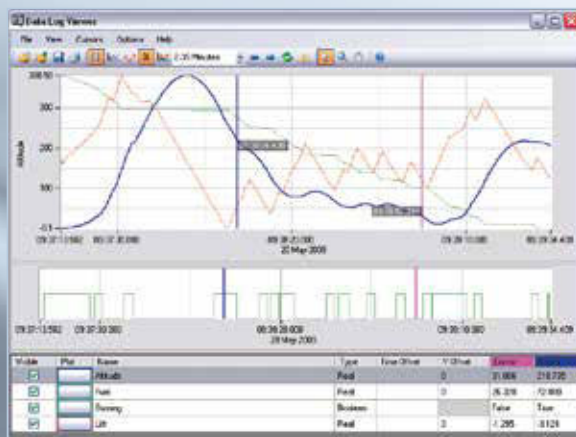
Viewing data logs.

With the data table, created by bringing the vertical and horizontal cursors together, you can analyse your machine's performance in minutes. Reporting is also easier: now you can export data as an image, CSV or directly to a printer.