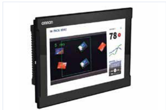
FH Vision Integration on NY IPC

Omron believes in and fully supports open technologies, so you are guaranteed the freedom to choose devices that best suit your machine or system. As a member of the OPC Foundation, Omron also supports open connectivity via open standards.