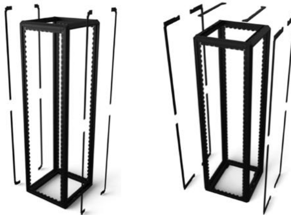
Dynamic load 250kg

Reinforcements built of 4 mm thick DD11 steel to ensure competitive cost and rugged performance with 250 kg loading in seismic regions. Vertical reinforcement brackets join in the middle of the frame height, with small stiffening angles at top and bottom