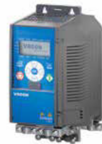
OPTION BOARD MOUNTING KIT