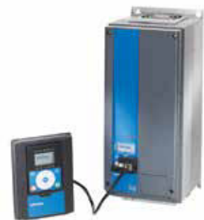
KEYPAD DOOR MOUNTING KIT